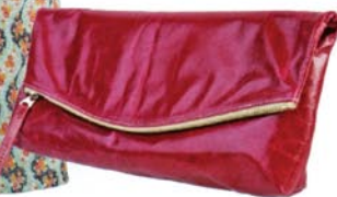
MANNE-QUEEN IS CONTEMPLATING ANOTHER DRINK IN: Tank $15.50 @ Abercrombie & Fitch Lanzarote dress $180 by Mon Petit Oiseau ("what a sweet bird") @ Raye Clutch $165 by Pivot @ Raye Wedges $131 by Charlotte Ronson @ Raye