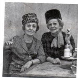
Diane Arbus' "Two Ladies at the Automat, N.Y.C. 1966"

traveling tour de force lands at the Museum