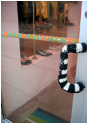
Knitta tag on Raye exterior