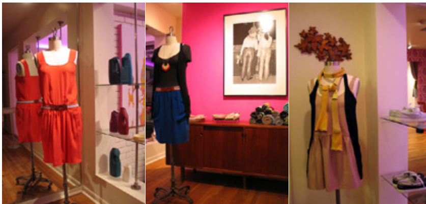
Sunshine & Shadow dress, Rachel Comey belt

Despite their mall-like synergy, each shop stands independently from the next, befitting the intimate, residential quality of Montrose.