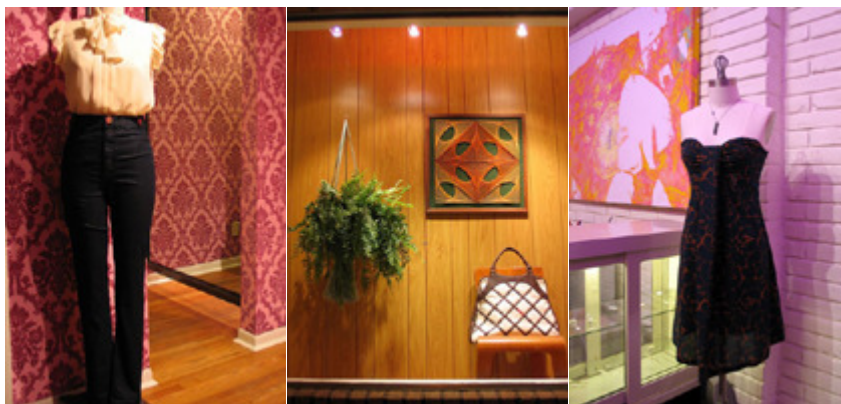
Lyell blouse with Grey Ant jeans

Fall picks include many of the above as well as Martin Margiela Ligne 6, Crispin and Basilio, Coven and Loeffler Randall .