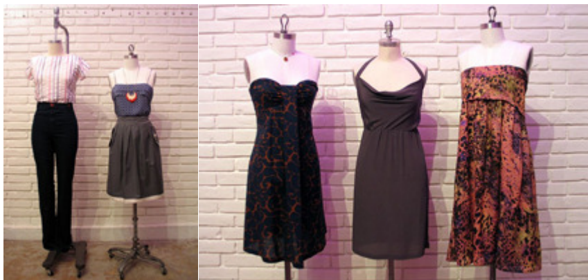
Steven Alan top with Grey Ant jeans, Lyell top and Borne skirt with Kyo Hashimoto necklace

Raye attracts a wide range of shoppers in-the-know and the shop's biggest fans tend to be between 25-35. The shop's price point is approximately $175-$350 for shoes and apparel. Sayeg looks to stock items that are reasonably priced for their high level of quality and design, opting out, she says, of the "cheap sell".