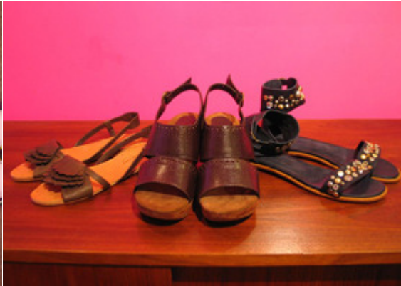
Rachel Comey shoes